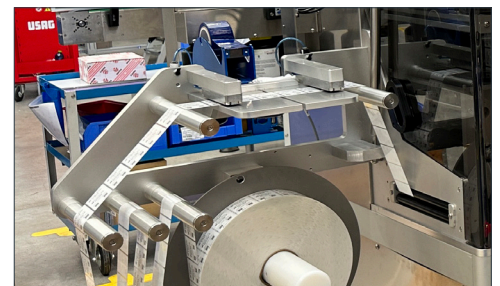
Integrated splice table provides easy access for quick and efficient label changeovers and replenishments.