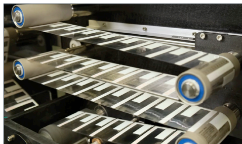
Dynamic web tensioner provides integrated web handling for continuous and intermittent label printing productions.